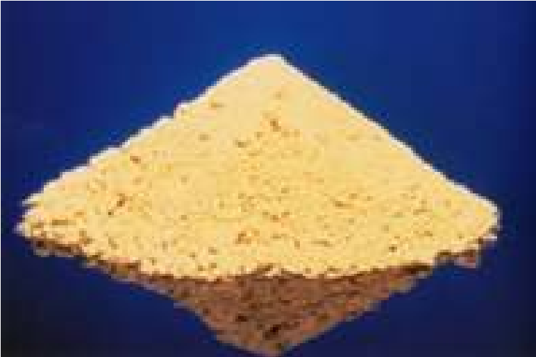
Sample of FGD gypsum

This case study describes the potential and current use of flue gas desulphurisation (FGD) gypsum as an ingredient in the manufacture of plasterboard. The study focuses mainly on FGD gypsum derived from coal-fired power stations but other sources of secondary and recycled gypsum are also mentioned. FGD gypsum is also commonly known as desulphogypsum (DSG).